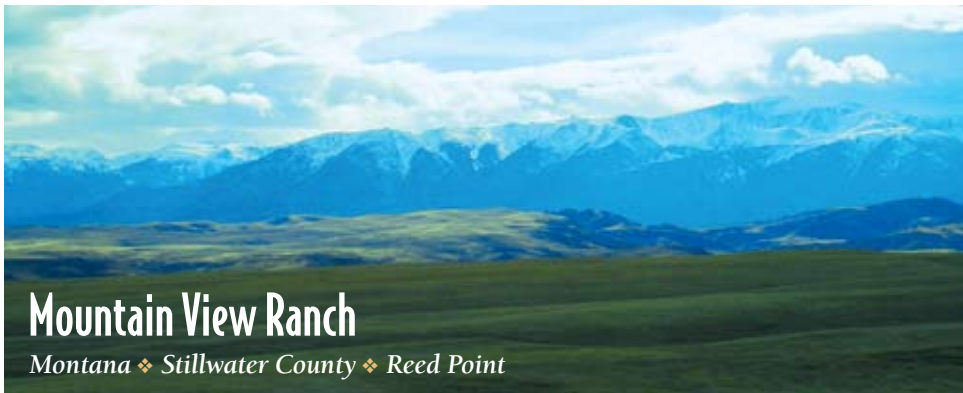
Mountain View Ranch Montana ♦ Stillwater County ♦ Reed Point

two- and one-half-bath home with a gourmet kitchen with Viking stove, fireplace, formal living/dining rooms, office and laundry room. Outbuildings include two barns, a garage, storage shed and a large RV garage/shop/office. A paved driveway, sprinkler system, perimeter fencing and landscaping complete this estate. $999,000.