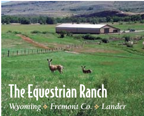
The Equestrian Ranch Wyoming ♦ Fremont Co. ♦ Lander

The Equestrian Ranch has 200± acres with a wonderful equestrian building (72' by 152') with arena, 16 stalls and an office/bath. Good property income comes from horse boarding and cattle grazing. Just south of Lander and only minutes north of the fabulous Sinks Canyon State Park, the ranch has a nice creek, which would be great for developing ponds for the fishing enthusiast, good water rights and very productive grassy meadows. For the hunter, it offers resident big game and game bird habitat. $2,000,000.