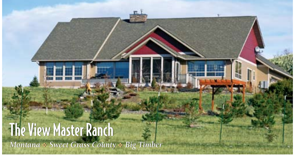
The View Master Ranch Montana ♦ Sweet Grass County ♦ Big Timber

This ranch is known for its majestic 360° mountain views. The main residence was thoughtfully planned to provide spectacular views of three mountain ranges: the fabulous Crazy and the Absarokee-Beartooth Mountains. This as-new home has fabulous finishes and upscale materials with a superb floor plan, which sets as a spectacular backdrop for the view in this highly desirable area of the Yellowstone River Valley. The guesthouse, on a high hillside, also provides panoramic views. The 948±-deeded-acre ranch offers varied terrain with rolling hills, steep buttes and wonderful natural pastures. $2,100,000.